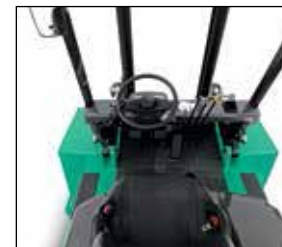
Audible and visual warnings, including a backup alarm, come standard