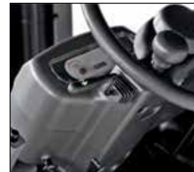
Small diameter steering wheel