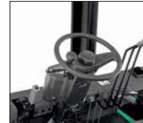
One of the highest lift speeds in its class