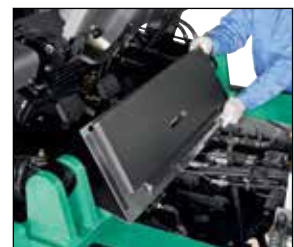
Electronic Controlled Automatic Transmission provides travel control with a single control lever