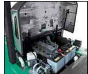
Built to produce less noise for operator comfort