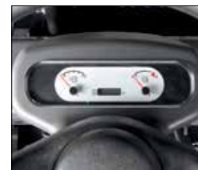
Dependable design providing a high level of safety