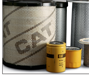
Genuine OEM parts