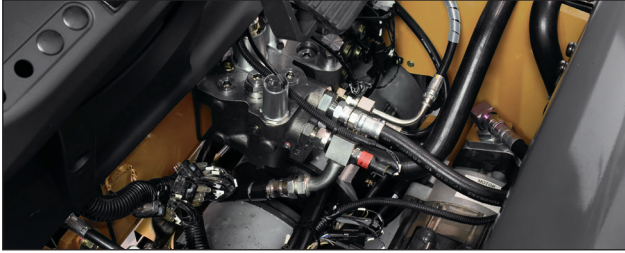
Factory warranty for added protection