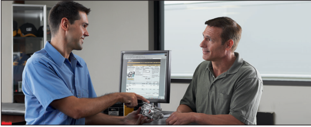
Local service and support