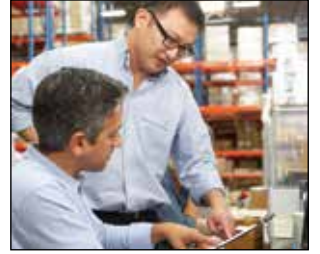
Custom financing packages