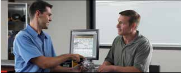
Local service and support