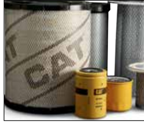
Genuine OEM parts