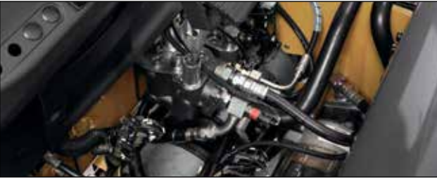
Factory warranty for added protection